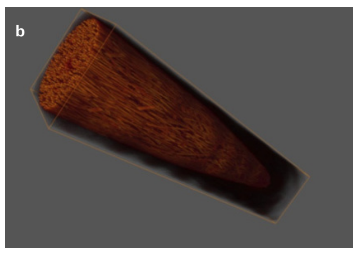
This 3D volume rendition of engineered polymer reinforced with glass fiber shows a (a) virtual cross-section and a (b) 3D image that illustrates the alignment of recycled fragments and virgin fibers in a narrowing injection-molded part. Individual fibers are 3µm in diameter.